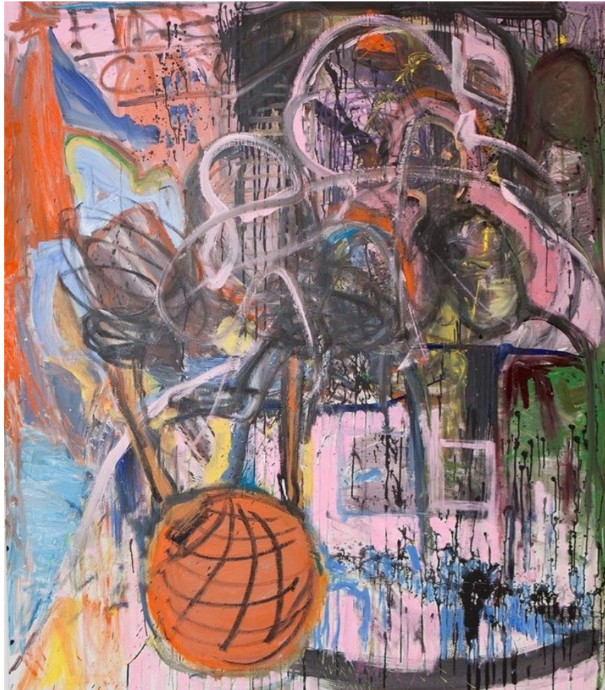
Fine City Directions Painting; 160 x 140. Acrylic, oil on canvas, 2019. NOK 38.000-