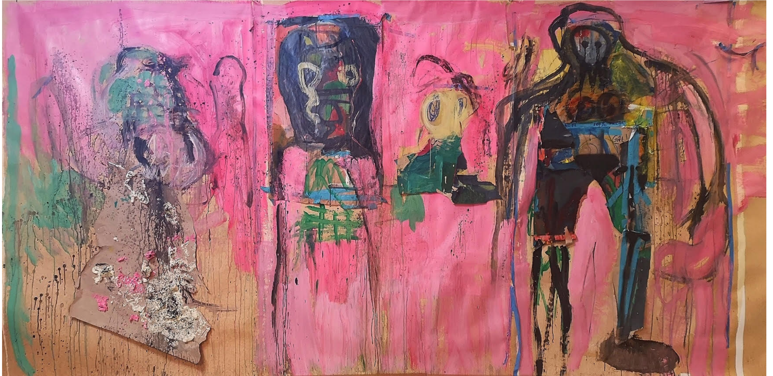
Family leaving the party Collage; 350 x 180 cm. Industrial paper, tape, glue, oil paint, acrylic paint, oil stickers, crayons, isolation foam, 2019. NOK 58.000-