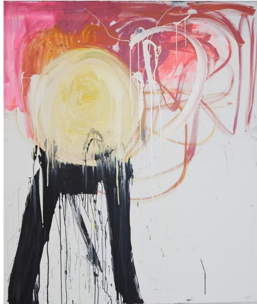
Human Heater Painting; 160 x 140. Acrylic, oil on canvas, 2019. NOK 38.000-