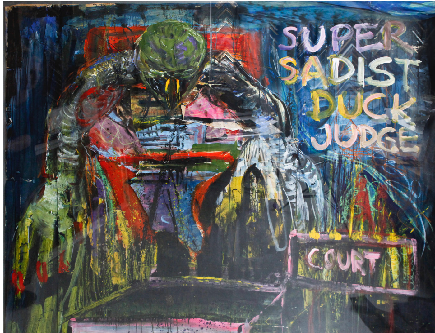
Super Sadist Duck Judge Collage; 226 x 200. Industrial paper, tape, glue, oil paint, acrylic paint, oil stickers, crayons, 2018. NOK 55.000-

The art world is not spared from this great fresco that the artist paints. Isolated values includes the artist's own environment. The work features wire drawers in which a plastic flap supports the image of La Baie des Anges by Marc Chagall. The great value of art shouldn't be limited to a specific environment, as that of art fairs, and its value does not coincide with the monetary value that is judged during these events. In Marte's opinion art has a much higher value, which is the ability to go beyond the androgynous aspect and to conceive the existence of a possible unity of the opposites. The men's attempt to escape from one of the two poles is absurd. Art is the only tool that can reveal the absurdity of trying to escape from something that not only belongs to us but that is in our very nature.