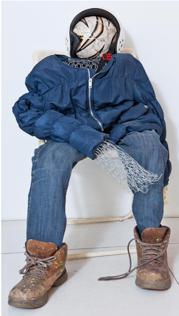
Mr. Gymnastic Sculpture; 110 x 40 x 40 cm. Football, helmet, outdoor jacket, jeans, leather outdoor shoes, metal mesh, tennis balls, outdoor chair, 2019. NOK 28.000-