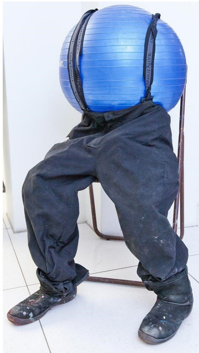
Mrs. Gymnastic Sculpture; 120 x 40 x 40 cm. Blue gymnastic ball, metal mesh, black alpin outdoor trousers, shoes with paint, grey pillow, outdoor chair, 2019. NOK 28.000-