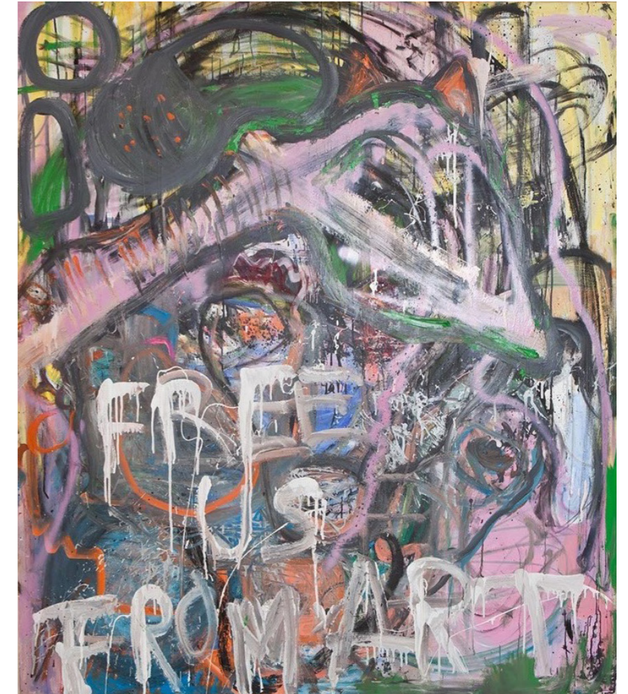
Free us from Art Painting; 160 x 140. Acrylic, oil on canvas, 2019. NOK 38.000-