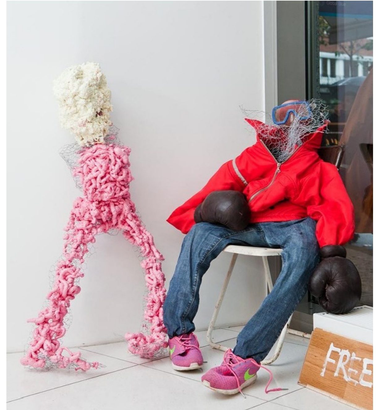
Herr Hansen Sculpture; 120 x 40 x 40 cm. Metal mesh, isolation foam, goat, glue, paper, painting brush, 2019. NOK 28.000-