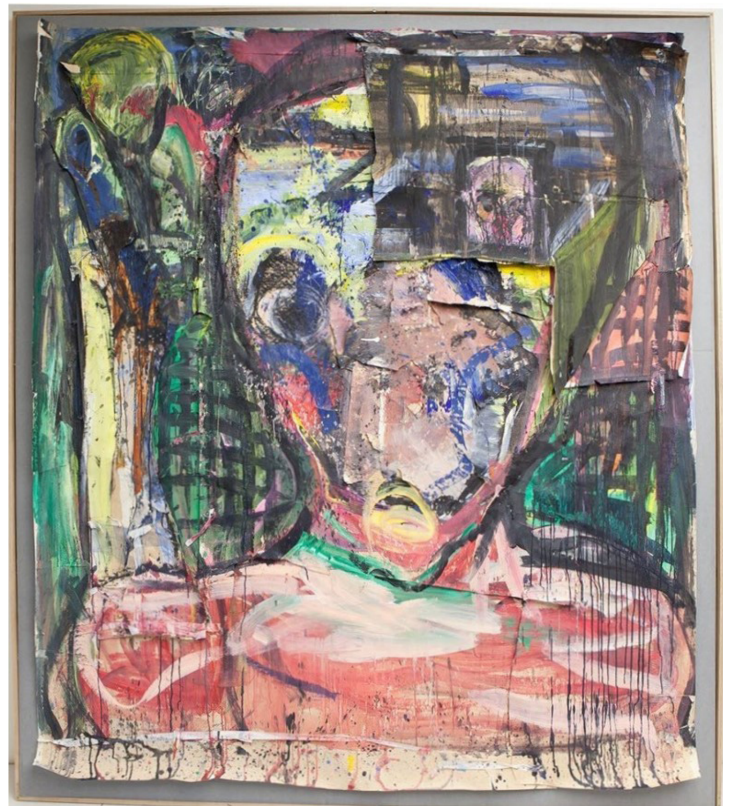
Citizen: Mr Androgyne Collage; 250 x 226. Industrial paper, tape, glue, oil paint, acrylic paint, oil stickers, crayons, 2018. NOK 55.000-